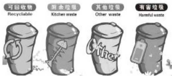
rubbish sorting system

About 350 communities have carried out this smart system in Beijing. The capital of China has joined a list of cities in the country that take action to support rubbish sorting. For example, Shenzhen and Shanghai have made laws to punish people and organizations for not sorting rubbish correctly.