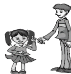
78. not so...as...