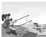
79. if, tomorrow