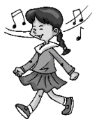
76. look, happy