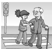
77. good, help