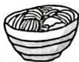
77. used to, for lunch