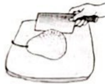
80. be careful to