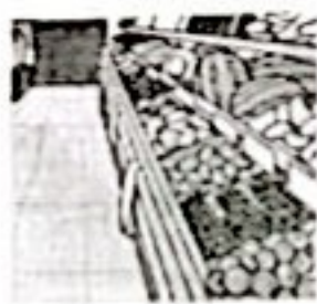
79. for sale