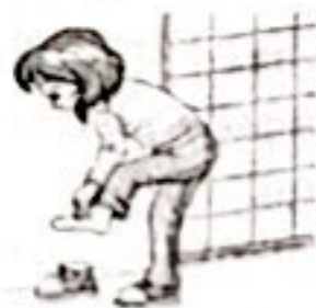
8. before entering, always