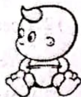
第 2 小题

( ) 3. This animal is small.It can jump !