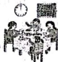
第 1 小题