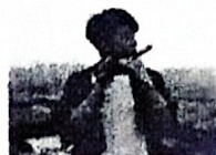
第 19 题

20.I think people will live under the_____ (海洋) in the future.