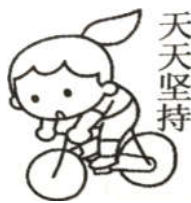
79. go, healthy