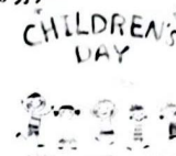
第 2 题图