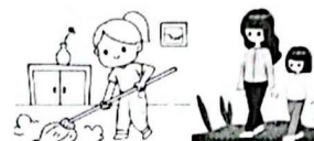
第 1 题图