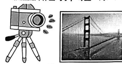
第 1 题图